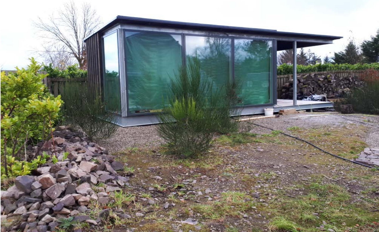
Close view from raised garden area within the applicant's plot

The material considerations in determination of this application are the Inverclyde Local Development Plan (LDP), the Planning Policy Statement (PPS) on Our Homes and Communities, the representations, the amenity impact of the building and its relationship to the application site and neighbouring properties.