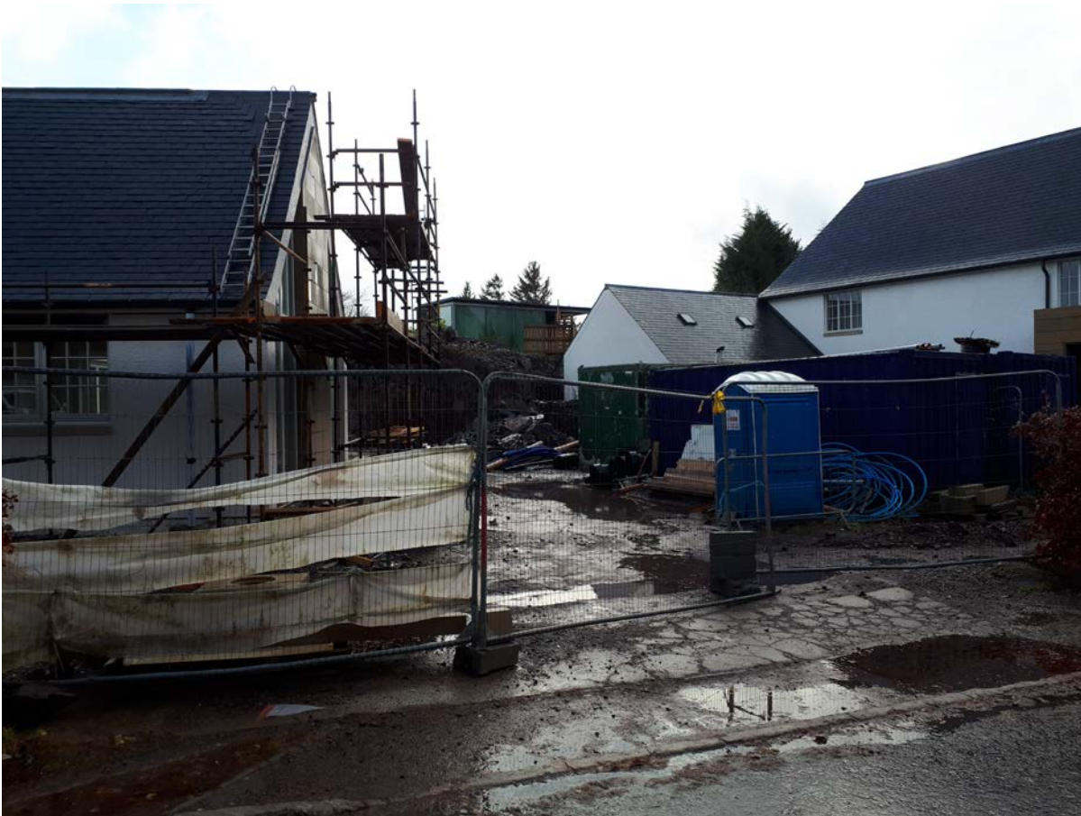
North-western view from Knockbuckle Lane

The position of the outbuilding on the upper garden terrace has caused concern to some objectors. This relates to visibility from the public domain and from nearby private residences. The fact that an ancillary building within a house plot can be seen does not make that building unacceptable but its impact has to be assessed. Whilst it is claimed that it can be seen from 9 houses (if upper levels are included) the greatest impacts requiring assessment are those within reasonable proximity. The outbuilding is set back approximately 39 metres from north-western views from Knockbuckle Lane and 53 metres from western views from Knockbuckle Lane. Whilst being in an elevated position, the photograph below shows an example of the limited view of the building which can be achieved from Knockbuckle Lane to the front of the house plot, glimpsed between the applicant's dwelling and garage and the dwelling under construction to its north-east. This will reduce further as screen fencing is built on the upper level between the plots. The applicant's garage and the neighbouring dwelling under construction have been included in the photograph to provide position and height context from street level.