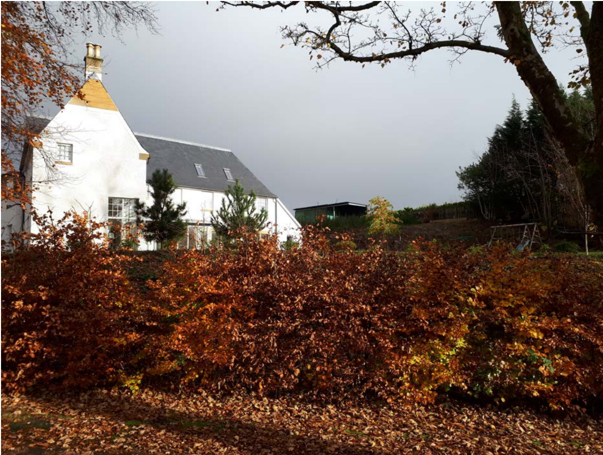
Western view from Knockbuckle Lane

immediately adjacent to the site. As only one of these is presently occupied I will first consider the dwelling to the south-east known as “The Stables”.