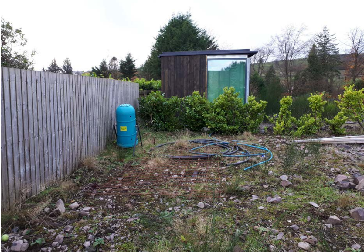
View from plot under development to the north-east

the context of the scale of both the associated dwellinghouse and the plot within which it stands. Both the associated dwellinghouse and plot curtilage are of large scale with the house approximately 10.5 metres in height and covering approximately 204 square metres and the plot extending to approximately 2,580 square metres. In this context, I consider that the outbuilding does not create any impression of overdevelopment and is of acceptable size relative to the plot.