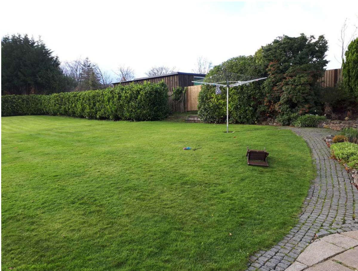
View from approximately the centre rear of "The Stables" immediately adjacent to the house

combination of the screen fencing and the laurel bushes the additional impact of the building on daylight and sunlight received by the wider garden area is negligible.